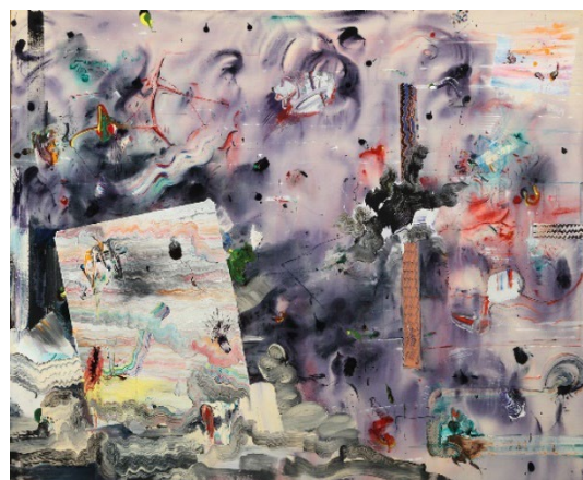
Herbert Creecy, Untitled (Violet) , 1977 Mixed media on canvas 72 x 84 in

764 Miami Circle NE, Suite 210, Atlanta, GA 30324