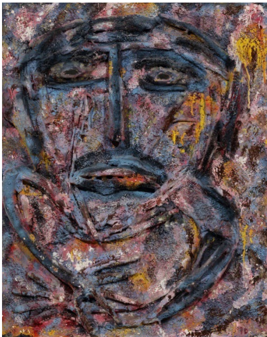
Thornton Dial, The History of the Dials , 1996 Glass, mirror, splash zone compound, wood, and mixed media on panel 60 x 48 x 5 in

With Sleeping Giants , Johnson Lowe Gallery pays homage to the inventiveness and originality of three artists who, to varying degrees, found themselves working on the margins of modern art's mainstream currents, even as, in their own ways, they may now be seen — and acknowledged — for having contributed substantively to the language and expressive power of the art of their time.