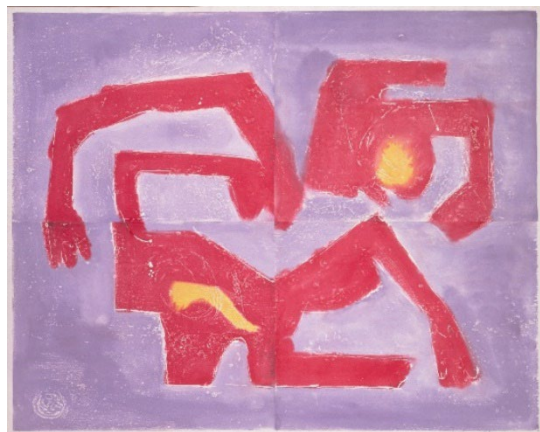
Sam Glankoff, Untitled , 1975 Water soluble printing ink and casein on Japanese paper 38.125 x 48.125 in

"Thanks to new ways of thinking about art history, especially due to the influence of postmodernist critical ideas, the overlooked or little-known legacies of some of modern art's most remarkable sleeping giants have been rediscovered in recent decades being appreciated anew. Now honored — and aroused — these artists' creative spirits and the ideas that inspired them gave rise to distinctive bodies of work for which a new generation of art historians, curators, critics, and collectors have been making room in modern art's familiar canon and in the broader story of its long, multifaceted evolution.